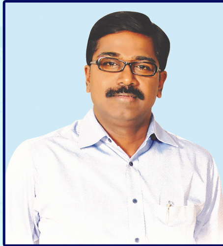
SRI PUVVADA AJAY KUMAR Honorable Minister for Transport Government of Telangana President, Mamata Educational Society, Khammam

After two decades of dental education, Mamata Dental College is known for imparting the best in dental education in a more purposeful manner.